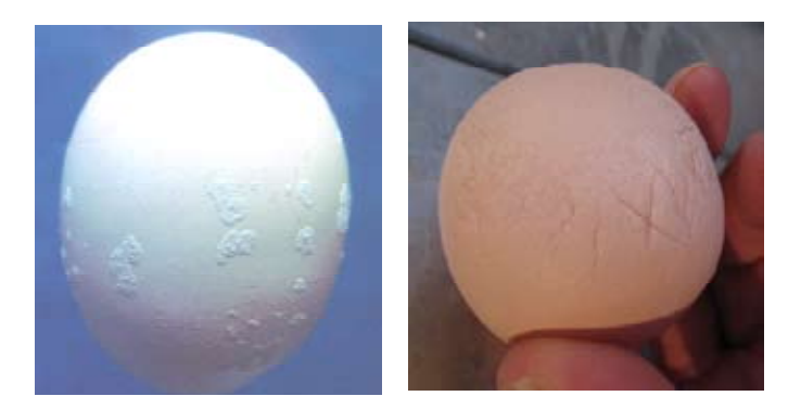
The egg on the left has calcareous deposits and the egg on the right has a soft shell.

Figure 2: Examples of egg defects caused by IBV infection