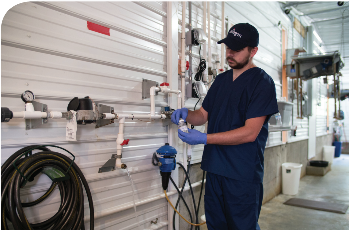
Sampling at the entrance of the house

Water disinfection during production is an integral part of a good flock management program. Controlling bacterial contamination and biofilm formation in the drinking system is key to reducing bird exposure to harmful organisms and minimizing the spread of disease. If allowed, chlorination is an effective way to achieve water sanitation, as it provides residual protection against recontamination, is easy to use and cost effective.