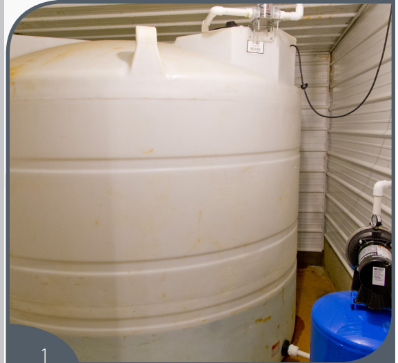
Holding tank for sanitized water