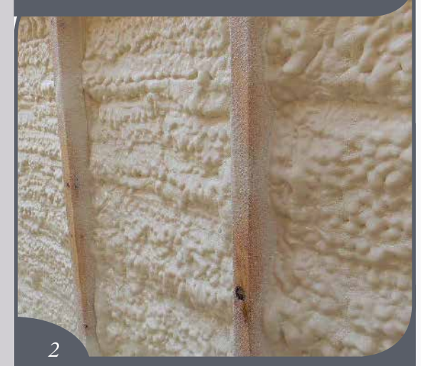
Insulation saturated with boric acid