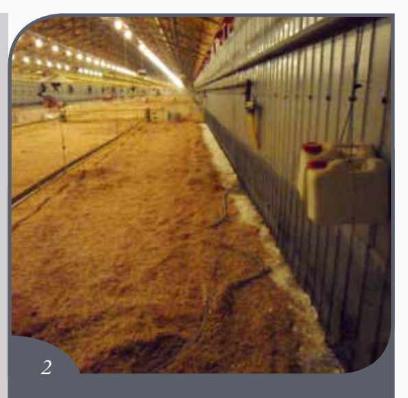
Boric acid application in the litter