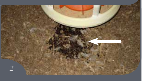
Darkling beetles under feeders