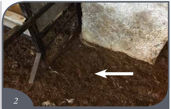
Darkling beetles under manual nests

• Insecticide application and a detailed cleaning and disinfection program are essential to control.