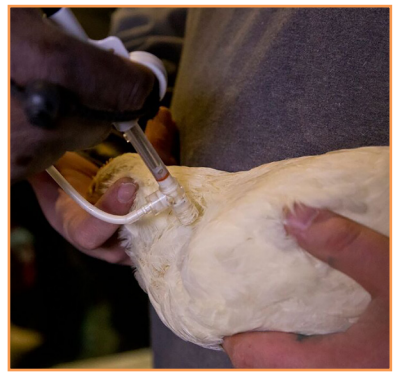
Figure 4: Correct SQ vaccination technique of the neck, tail, and inguinal fold.

When performing SQ injections, the vaccine should be applied at distal third of the neck. It is critical to avoid personnel self-injection as this could lead to serious injury and also to avoid injections too close to the head, the base of the neck or neck muscles ( Figure 4 ). The use of new sterile needles is recommended and regular replacing (at least once every 500 birds) is encouraged. For SQ injections needles should be 18-19 gauge and 0.4 in to 0.5 in (10 mm to 12 mm) in length. In the case of IM injections the recommended needle dimensions are 18 gauge and 0.25 in (6 mm) in length. Blunt needles and needles with burs must be replaced immediately. Dull needles require more force to penetrate the skin and may potentially cause unnecessary tissue damage. The correct size needle must be selected according to age of birds, site of injection and type of vaccine used.