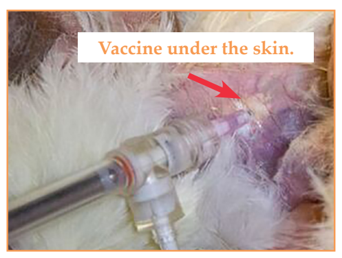
Figure 6: Visualization of SQ vaccination under the skin (left) and in the breast muscle (IM) (right). The photo on the right is of post mortem evaluation and is shown to demonstrate correct IM vaccination into the breast muscle.

Visual inspection of the vaccination technique and deposition of the vaccine at the correct site is the best method to determine accuracy of the injection. With the SQ injection in the neck, the feathers at the site of injection can be separated to allow visualization of the vaccine under the skin ( Figure 6 ). Wet feathers indicate that the vaccine was poorly administered and either full or partial dose ended up in the feathers due to anticipated or delayed expulsion of the vaccine from the syringe. Inspection timing is important; make sure the examination is done within an hour of vaccination. Unannounced visits to evaluate the vaccination crew technique are preferable to get a true picture of the job being done. To visually evaluate the vaccination procedure for the purpose of properly training the vaccination crew on IM injections, some sex slips (sex errors) can be euthanized to inspect the site of injection.