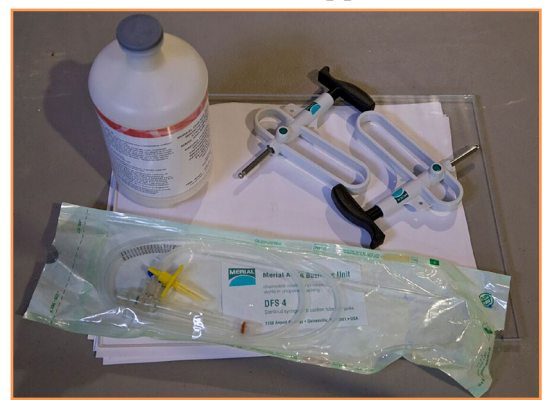
Figure 1: Vaccination supplies and cooler/warmer used to keep vaccine at the correct temperature.

General recommendations are to remove the vaccine from the refrigerator 24 hours ahead of vaccination and allow it to stay at room temperature. Bacterin manufacturers advise warming their products to 27-29 °C (80-85 °F) using a warm water bath before injection to reduce local reaction and facilitate application ( Figure 1 ). To avoid breaking the emulsion, do not freeze or overheat bacterin vaccines. Be aware that other killed vaccine products, such as viral killed vaccines, can be warmed up to 37 °C (100 °F) which may cause issues for bacterins. Overheating bacterins could release more endotoxins causing severe tissue reactions and liver/spleen issues, resulting in hen mortality (often called post-bacterin hemorrhagic syndrome). It is recommended, therefore, to have a separate warm water bath strictly for bacterins.